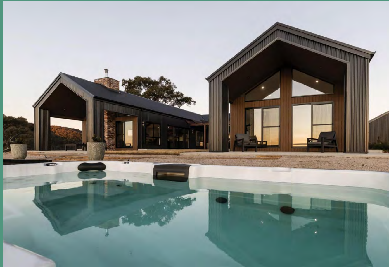
DALLIMORE HOUSE - AARON SCHUMACHER DRAFTING

BUILDING DESIGNERS ASSOCIATION OF AUSTRALIA