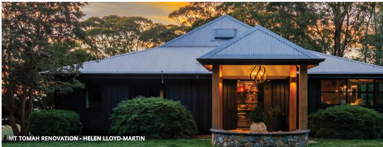
MT TOMAH RENOVATION - HELEN LLOYD-MARTIN

Accredited building designers applying for registration under the NSW Design and Building Practitioners Act 2020 and have been referred to the BDAA for assessment, will be required to undergo a supplementary audit. This will be a 'one-off' audit that will incur a fee. See page 15.